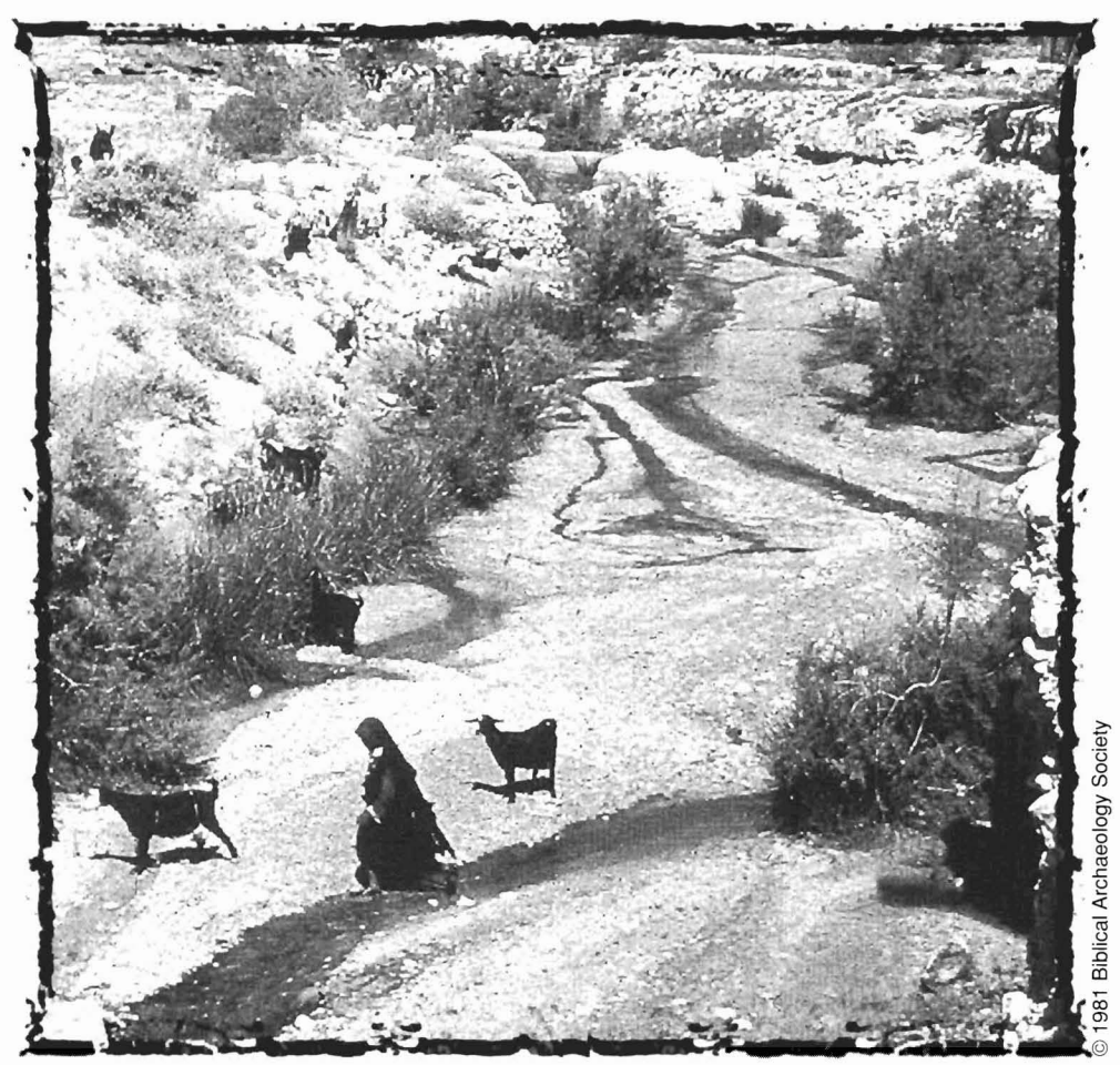
Wadi in Canaan

This lesson looks at the two books of Samuel. Although these two books were once considered to be a single work in Hebrew, the Greek translators of the Old Testament divided the work into two parts. Our English tradition followed the Greek practice.