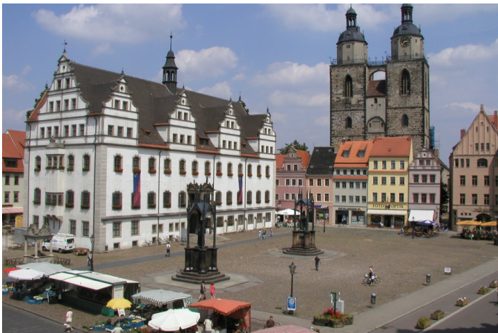
Town Square - Wittenberg